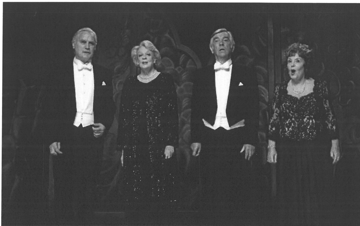
Billy Connolly (left) Maggie Smith, Tom Courtenay and Pauline Collins are performers reunited in a rest home in Dustin Hoffman's "Quartet."